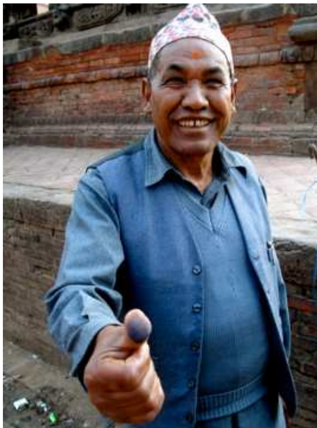
Constituent Assembly Election 10 April 2008: First man to vote in Kathmandu after three hours of waiting.

Further, the success of the post-conflict process is also due to the strong local ownership of the political framework. Nepal benefited from assistance and support from international actors throughout the peace and electoral processes, but the structure of both the CPA and the elections were outcomes of Nepali actors' own initiatives and previous experience. This factor increased commitment on the part of the major actors, gave the process additional legitimacy among politicians and the public in Nepal, and facilitated solutions